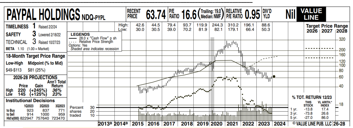
Notes: Date of pdf: 02/02/2024. The dates on header rows above are: 4 PM March 22, 2024