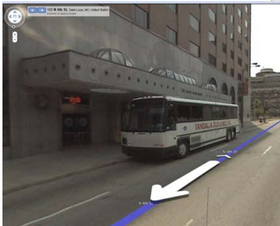
"B" Hyatt Regency 4th Street Entrance