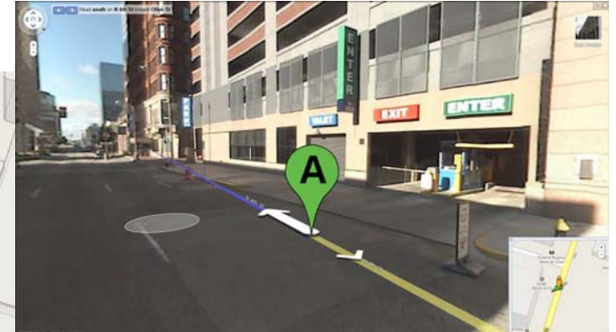
"A" Mansion House Garage