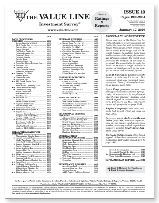
Ratings & Reports

Every week subscribers receive a new Issue of Ratings & Reports containing approximately 130–140 company reports grouped by industry, and a smaller number of industry reports. The industry reports precede the reports on the companies in that same industry. Over the course of three months, revised reports on all approximately 1,700 companies and nearly 100 industries are issued.