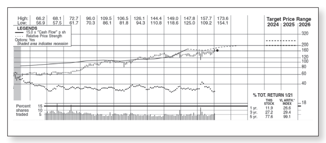
Sample Target Price Range

In the left hand column of each report, we include our 3to 5-year Target Price Range (item 19) projections. There you can see the potential high and low average prices we forecast, the percentage price changes we project, and the expected compound annual total returns (price appreciation plus dividend growth). To make these calculations, analysts compare the expected prices for the next three to five years (as shown in the Target Price Range and Projections box)